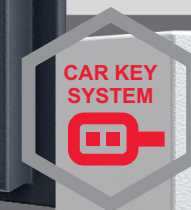
CAR KEY SYSTEM