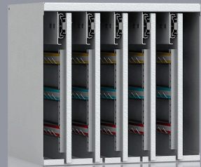
THE SYSTEMS OF KEY INSERTS