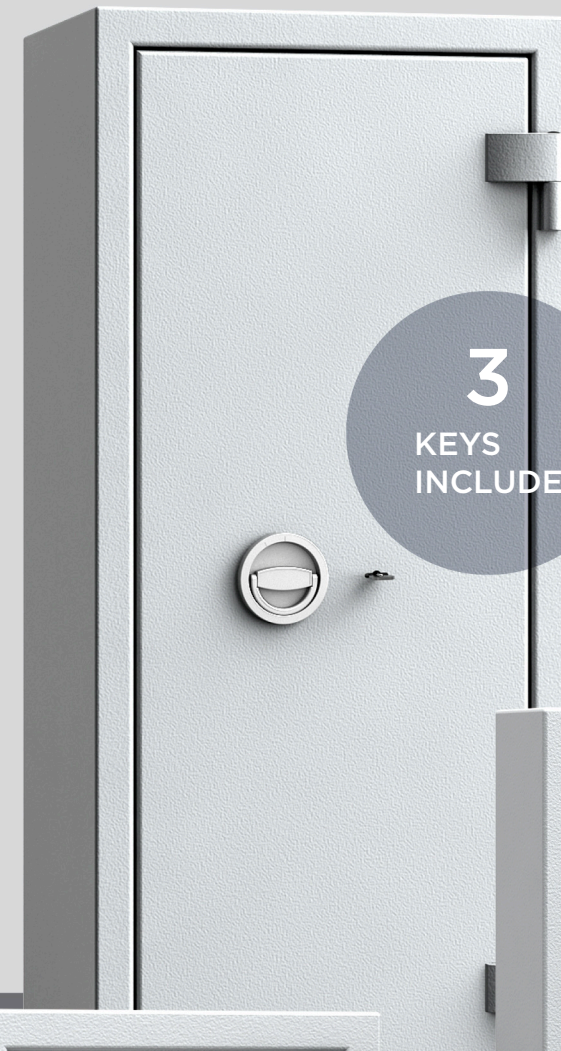
3 KEYS INCLUDED