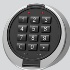
Electronic lock - Primor 3000 level 5