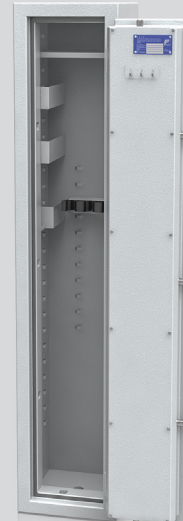
55629.02 Elektronic lock Stellar Basic RAL 7035