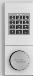
Electronic lock - B 90