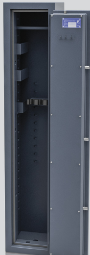
55629.11 Key lock RAL 7024