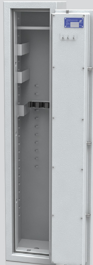
55629.01 Key lock RAL 7035