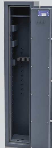
55629.12 Elektronic lock Stellar Basic RAL 7024