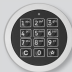
Electronic lock - Stellar Business