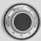
Mechanical code lock