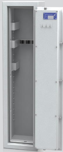
55630.01 Key lock RAL 7035