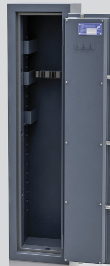
55630.12 Elektronic lock Stellar Basic RAL 7024