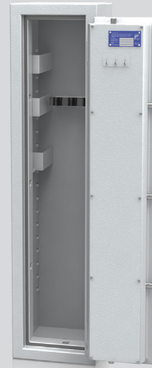
55630.02 Elektronic lock Stellar Basic RAL 7035