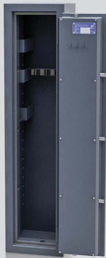
55630.11 Key lock RAL 7024