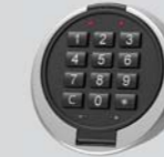
Electronic lock - Anchor 7000