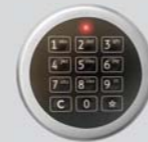
Electronic lock - Stellar Business