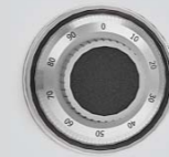
Mechanical code lock