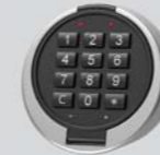
Electronic lock - Primor 3000 level 5 or level 15