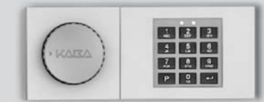
Electronic lock - B 90