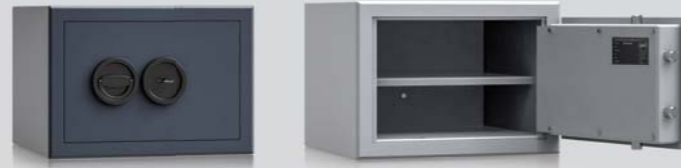
34100.11 / 34100.01