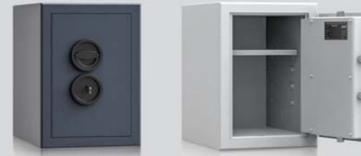
34101.11 / 34101.01