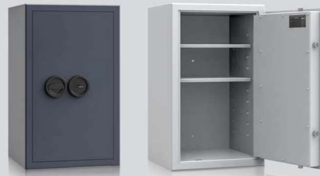
34103.11 / 34103.01