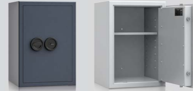
34102.11 / 34102.01