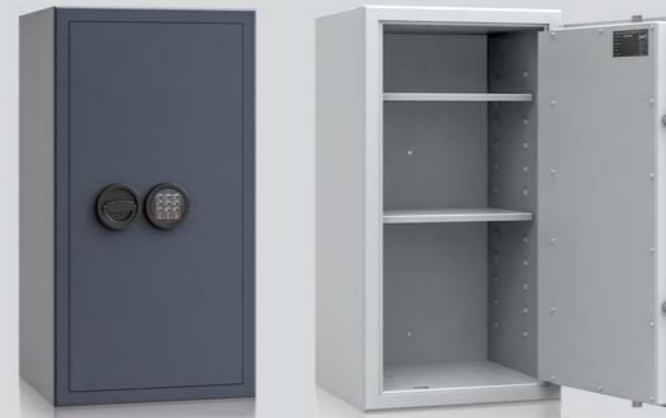
34104.12 / 34104.02