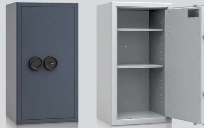
34104.11 / 34104.01