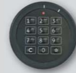
Electronic lock - Stellar Business

34100.01 / 34100.11 34100.02 / 34100.12 34101.01 / 34101.11 34101.02 / 34101.12 34102.01 / 34102.11 34102.02 / 34102.12 34103.01 / 34103.11 34103.02 / 34103.12 34104.01 / 34104.11 34104.02 / 34104.12