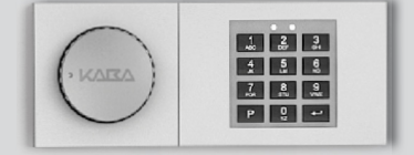
Electronic lock - B 30