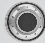
Mechanical code lock