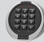
Electronic lock - Primor 3000 level 5