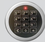
Electronic lock - Solar Business