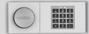
Electronic lock - B 30