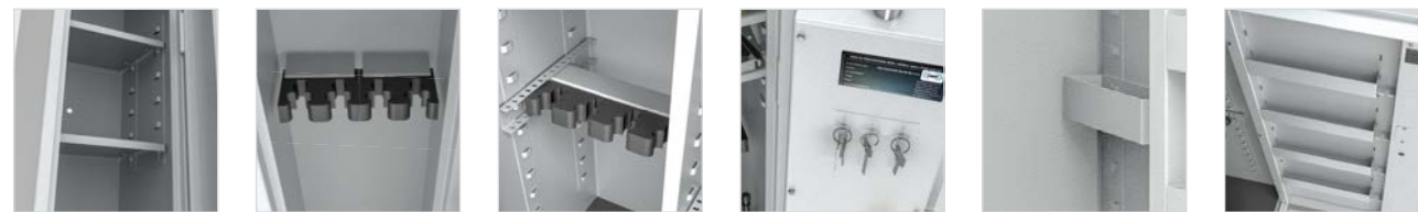
Adjustable shelf Adjustable rifle holders on magnets (foam holder gauge 55mm) Adjustable rifle holders on rail (foam holder gauge 65mm) Hook bar Storage boxes Storage boxes on door