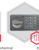
Electronic lock (Excl. 33000-33001)