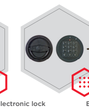
Electronic lock with mechanical emergency