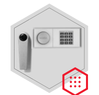
Electronic lock B 30 (Excl. 413100.00)