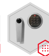
Electronic lock Solar Business