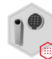
Electronic lock Primor 3000 level 5