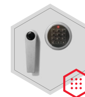
Electronic lock Solar Basic