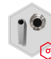
Mechanical code lock