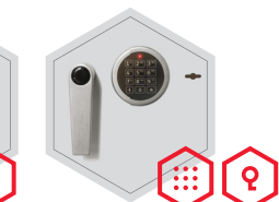
Electronic lock with mechanical emergency