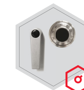
Mechanical code lock